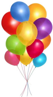
Lainey Strange 11/14

A mere picture couldn't capture the kindness of the staff members with birthdays.